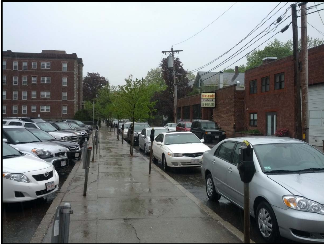
Parking in the Day Street Parking Lot (left) and on Day Street (right)

In aggregate, there are approximately 402 existing parking spaces within the study area. This is inclusive of all parking spaces, including metered parking, residential parking permit only spaces, 5-minute and 15-minute only parking spaces, handicap only parking spaces, Zipcar parking spaces, and loading zone spaces. Excluding the residential permit parking only spaces and loading zone parking spaces, the total is approximately 380 parking spaces. The total number of metered parking and unmetered/unregulated parking spaces only is approximately 351 parking spaces.